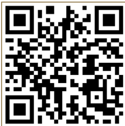
2025 – 2026 Benefits-at-A-Glance