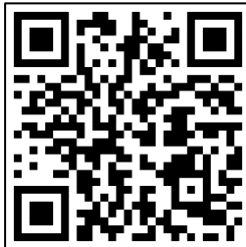
2025 -2026 Rates & Contributions