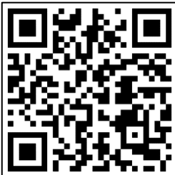
2025 -2026 Annual Compliance Notices